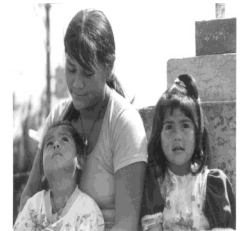
A mother comforts her children after their father was killed in a massacre. Many Colombian families have lost loved ones to Colombia's conflict.

According to the United Nations, 21 percent of employed Colombians work in agriculture, the vast majority in rural areas. Research on the impact of free trade agreements between underdeveloped countries, such as Colombia, and countries with large economies, such as the United States, show that underdeveloped countries lose a significant number of agricultural jobs. For example, independent studies indicate that in Mexico at least 1.3 million family farmers have been displaced from their agricultural production due to subsidized imports from the United States.