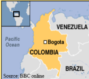
Colombia, with a population of 42 million, is located in northwestern South America.

Clergy and lay church leaders are especially at risk in Colombia's conflict due to their work for peace and justice amidst war.