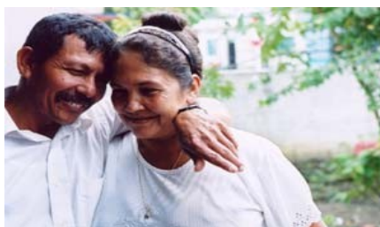
Colombian families find joy amidst war.