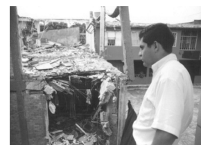
A Colombian mayor looks over the ruins of his offices after a rebel bombing.

“We ask that you consider our concerns in order to find the authentic paths for justice and peace for Colombia.”